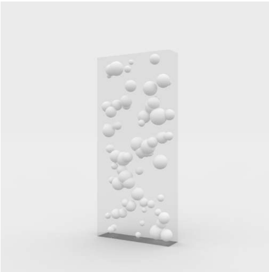
Figure 12: A strange object

In the year 2xxx, an expedition team landing on a planet found strange objects made by an ancient species living on that planet. They are transparent boxes containing opaque solid spheres (Figure 12). There are also many lithographs which seem to contain positions and radiuses of spheres.